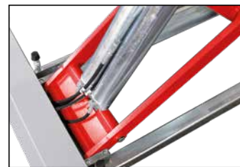
Strong support of cylinder and removable connections on base and runway for simpler maintenance.