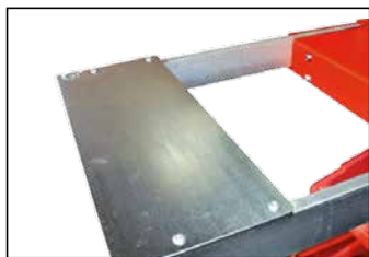
Runway with pull-out extension .

Runboard available with extensions only. Configuration for flush installation.