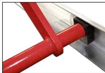
Generously sized, self-lubricating sliding blocks.