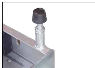
Special lift linkage , for lifting loads even from the lowest lift height.