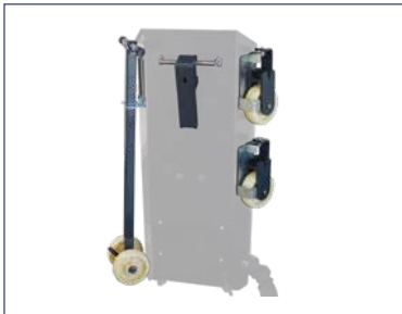
8-41100228 KIT ON CARRIAGE Consisting of wheels and manual lever