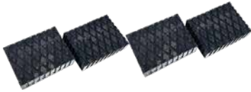
RUBBER BLOCKS Kit of 4 pcs H=40 mm